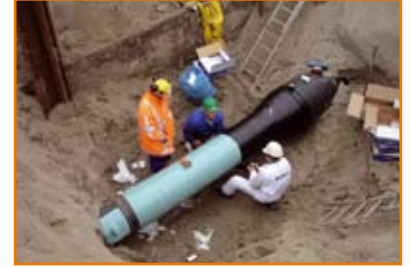
Easy application at reducers