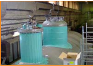
Conforms to any shape