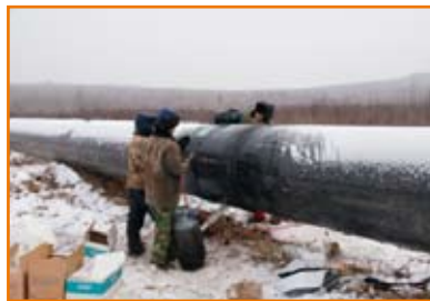
Application at sub zero temperatures; -30 C