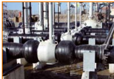
Mechanical protection with Outerwrap