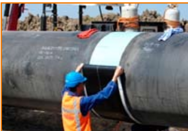
Mechanical protection with High Impact shield