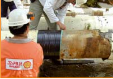
Surface preparation minimal St2