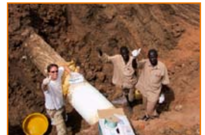
Mechanical protection with Outerglass Shield