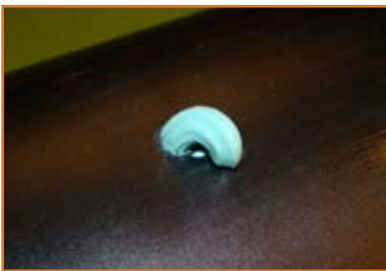
100% Self-healing, even after hot water immersion