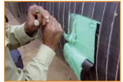
Worldwide accepted and approved