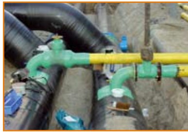
Wide range of applications