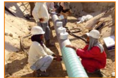
Application at high temperatures; +50 C